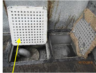
Strainer plate on top of bilge well