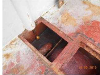
Bilge well without strum box or strainer